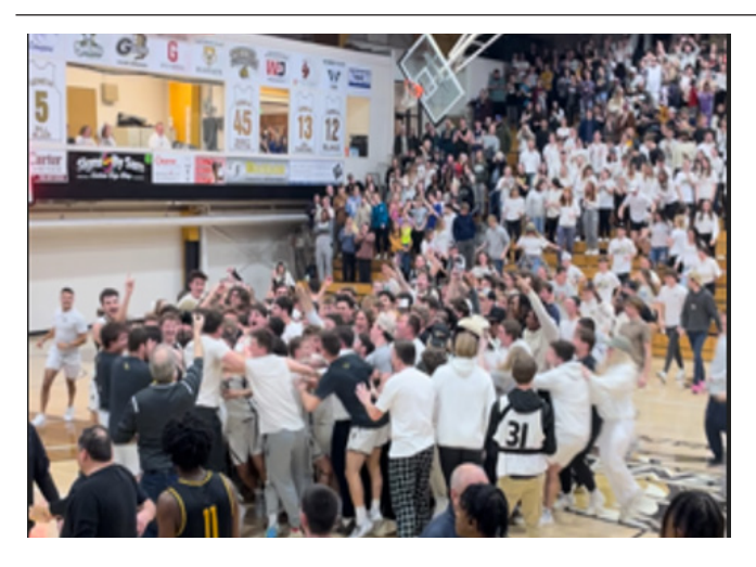
Geneva fans celebrate after the final whistle of the PAC Championship