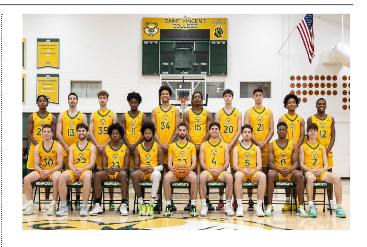
This year's Men's Basketball Team ended the season with a final overall record of 23 wins to 5 loses.

In front of a packed gymnasium at Saint Vincent College, the men's Saint Vincent basketball team pulled off a nail-biting victory in overtime to book their place in the final of the Presidents' Athletic Conference Championship Tournament, beating Chatham 88-83. As the final whistle barely echoed through the screams of both the players and the delirious crowd, there was a real belief that this year could be the one. Around the same time, news filtered through that Geneva had just edged past Grove City in similar fashion. The Bearcats were to face Geneva in the PAC Championship.