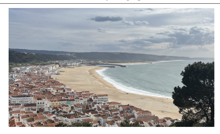
The landscapes of Portugal were another sight trip attendees captured.

In contrast, last year's McKenna School spring break trip was taken to Munich, Germany, and trip attendees stayed in one hotel there, taking a bus to different locations throughout the week.