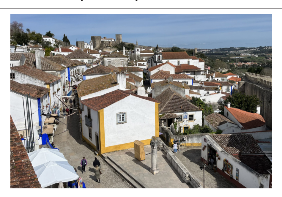
Portugal features unique architecture in many pictures taken by trip attendees.

Have you dreamed of spending a little time in Europe? Several Saint Vincent College (SVC) students and professors made that dream a reality this past week when they embarked on a week-long trip to Portugal over Spring Break! Travelers departed from Pittsburgh International Airport on Friday, March 1, headed for Lisbon, Portugal, and returned to the United States on Saturday, March 9. The trip lasted for nine days and was filled with once-in-a-lifetime memories of charming Portuguese architecture, castles, European cuisine, and beautiful landscapes.