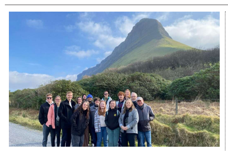
The trip attendees took a group photo near Ben Bulben, a flattopped rock formation that is part of the Dartyry Mountains in County Sligo, Ireland.