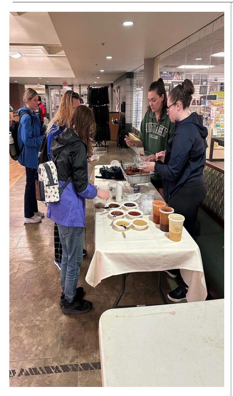
Attendees check out VALT's "Nuts not Drugs" event

Looking for something fun to do on campus while also making healthy choices? VALT has you covered!