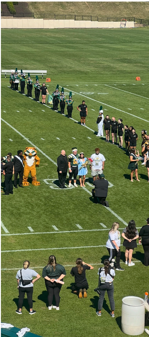
The Homecoming Court ceremony took place during halftime of the Saint Vincent College versus Allegheny football game.