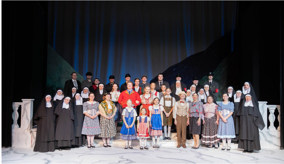
The cast of The Sound of Music