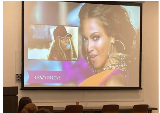
Attendees listened to Beyoncé as they ate dinner and discussed nuances of relationships.

February is Dating Violence Awareness Month, and to raise awareness about this issue that affects approximately 41% of women and 26% of men (Center for Disease Control), the Office of Student Affairs and the Title IX Office have coordinated weekly dinners. Each dinner centers on a different aspect of relationships as well as a different musical artist, with the attendees discussing what it means to be in a relationship based on what different artists represent in their music.