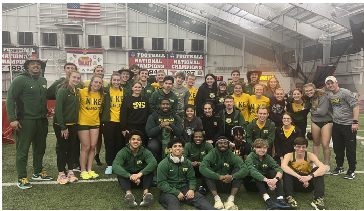
The Bearcat Men's Track and Field Team poses for a photo after Indoor PAC Championship.

Track and Field recently concluded its Indoor season, after competing in several meets mainly throughout January and February, where individual Bearcats, ranging from freshmen to seniors, had career performances. These occurred at the PAC Championships, on Saturday, Feb. 22, in Youngstown, Ohio, and at the AARTFC Indoor Championships, on Saturday, March 2, in Rochester, New York.