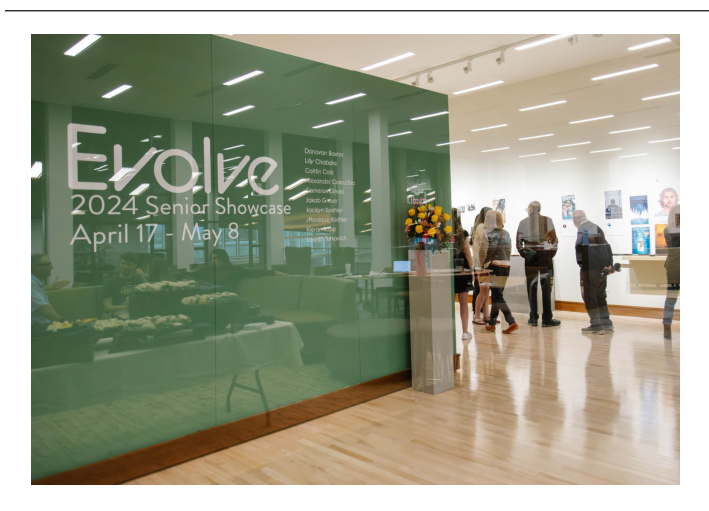
The title wall for Evolve: 2024 Senior Showcase in the Verostko Center of Art during the opening reception.

Come and see the beautiful artwork of Saint Vincent College's (SVC) 2024 graduating class at the new Verostko Center exhibition, Evolve: 2024 Senior Showcase.