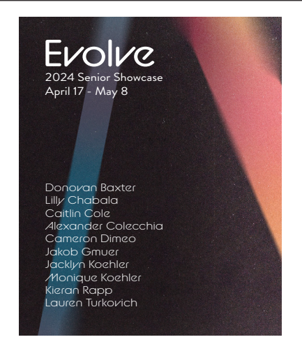
Exhibition poster designed by Donovan Baxter

Baxter praised the students and faculty of the art and design department and spoke about the inspiration for his featured pieces.