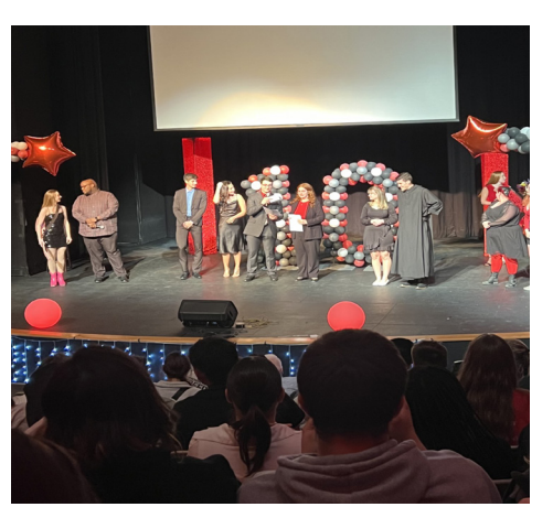
The four team leaders and their final remaining contestants stand on stage.

Sometime during the Voice, after being urged by students, Kane agreed to sing a song of his choice at the The Voice finale if the Esports stream reached a particular number of viewers. It did reach that number, at over 250 viewers, leading to Kane solo performing Ce-Lo Green's song 'Forget You' for an ecstatic crowd.