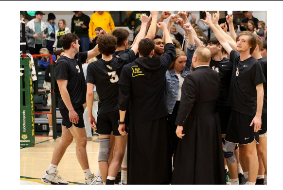
The Bearcats gather in a huddle with their Coach and several monks.