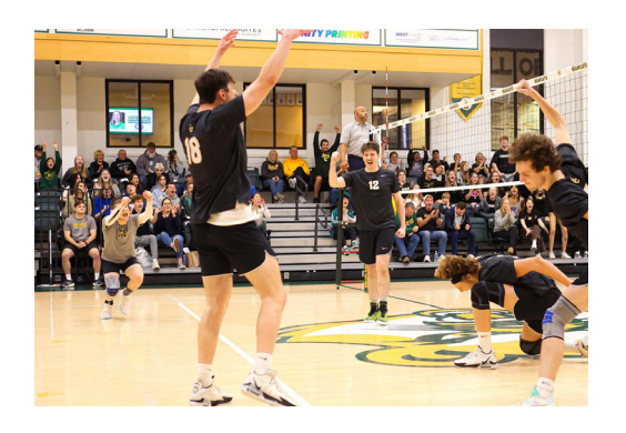
The team celebrates after a successful set.

L he Saint Vincent College (SVC) Men's Volleyball team were crowned the regular season champions of the Alleghany Mountain Collegiate Conference (AMCC), with a 9-0 conference record. The Bearcats were given the one-seed in the conference championship tournament, and on April 12, they faced off against the fifth-seeded Penn State Behrend in the Carey center gymnasium.