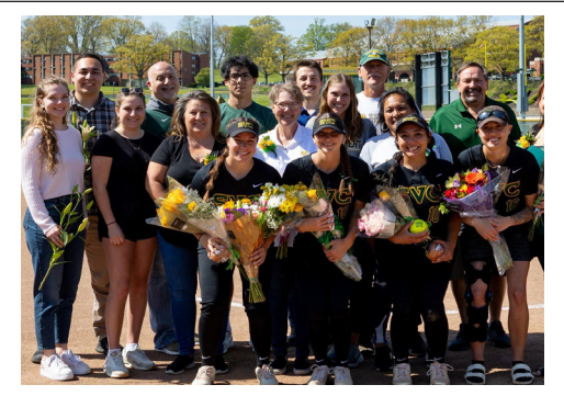
The senior Softball players pose for a picture with their families during Senior Day festivities.

"Coming in as a freshman was scary. Covid was around and I