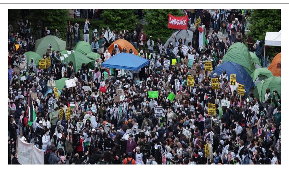
Activists and students participate in an encampment protest at the University Yard at George Washington University on Thursday, April 25.

n Oct. 7, 2023, Hamas-an organization described by The Council on Foreign Relations, PBS News, and other sources, as an 'Islamist militant movement', and designated by the U.S State Department as a terrorist organization in 1997-launched rockets at Israeli communities from the Gaza strip, killing an estimated 1,200 people and taking 200 hostages. This resulted in a declaration of war by the Israeli government, who then launched multiple aerial strikes on Gaza. Although the government claims it was intending to defend itself from Hamas, according to U.S News, more than 33,000 Palestinians have been killed in Gaza as of April 15.