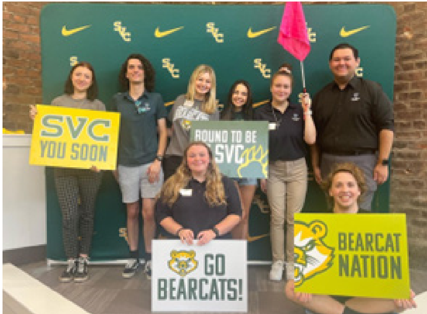
Commuters pose to show their SVC pride.

What is it really like being a commuter student on a college campus? Can you really get ‘the college experience’ without living in the atypical college dorms? Saint Vincent College (SVC) is committed to ensuring that the answer is yes for commuters and residents alike.