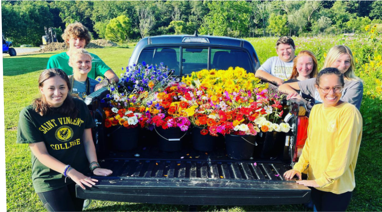
SVC Ambassadors make it their mission to support their college and local communities, helping small businesses such as Hidden JEM Flowers.