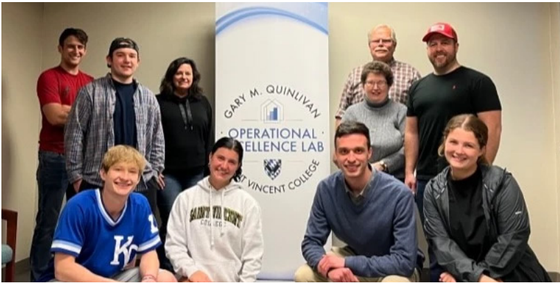
Some classes are given the opportunity to participate in manufacturing processes in real time using the new OE lab.

The Gary M. Quinlivan Operational Excellence Lab has become a core component of the McKenna School and the Master of Science in Management: Operational Excellence program. The lab grants faculty the ability to teach other organizations who look to implement Operational Excellence themselves. Located on the first floor of Aurelius Hall, construction of the lab began in Sept. 2022, and it opened in Spring of 2023.