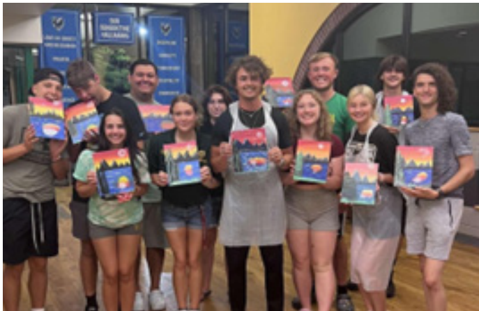
Commuters show off paintings they made at one of the on-campus commuter activities.